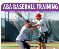
ABA BASEBALL TRAINING

Teague Middle School Begins May 28 Games, activities, swimming and field trips for ages 13 to 15.