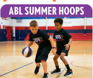
ABL SUMMER HOOPS

Merrill Park Begins Week of June 17 Fundamental development and skill training for ages 7 to 15.