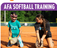
AFA SOFTBALL TRAINING

Eastmonte Park Begins Week of June 10 Hitting, infield, outfield, pitching and catching for ages 7 to 15.