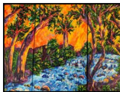
1st Place Acrylic Painting Eva Brock