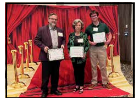
Volunteers of the Year