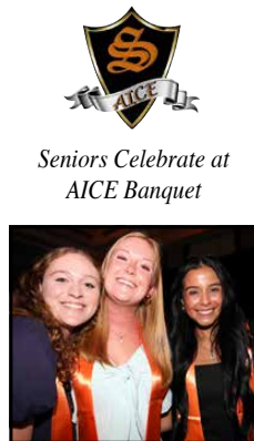
Seniors Celebrate at AICE Banquet