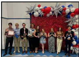
State Science Winners