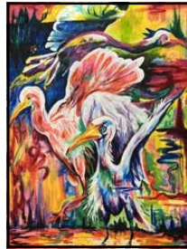
2nd Place Acrylic Painting Eva Brock