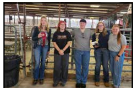
FFA 4-H Winners