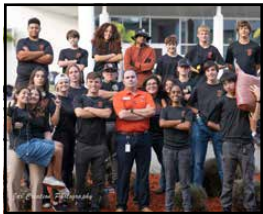
All Hands On Deck