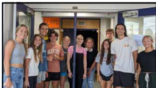
FCA Leaders Welcome Students