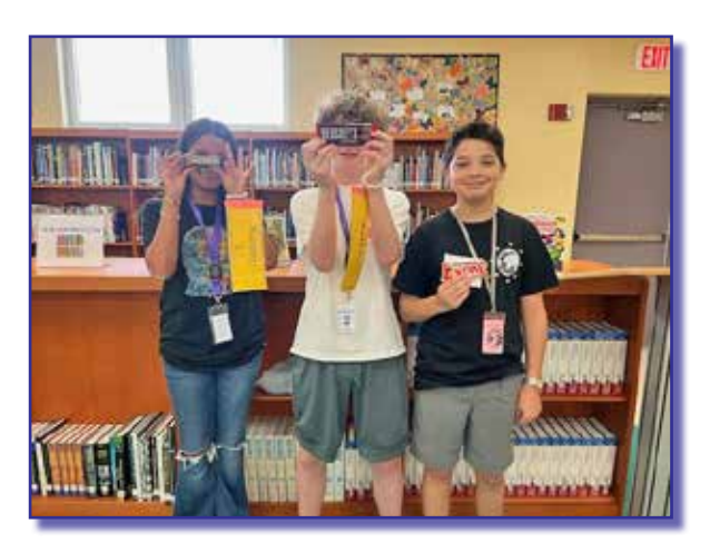
Winners of our first Brainteaser