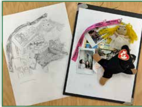
Two in-progress student Still Life drawings