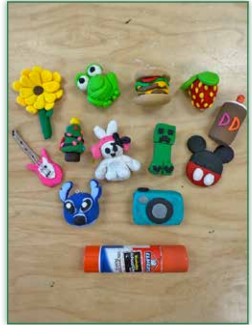
Various polymer clay sculptures by various students. Glue stick for size comparison