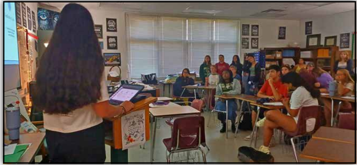
A reader lives a thousand lives before he dies... The man who never reads lives only one. George R.R. Martin