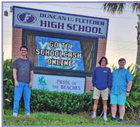
National Merit Semifinalists