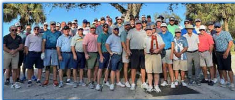
2-Man, 2 Day Golf Fundraiser