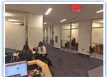
Hallway & Counselor Offices