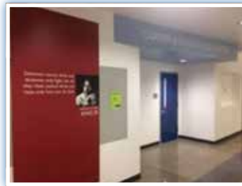
New Entry to Career & Counseling Center

We are in our new facility! After spending some time unpacking and organizing and moving desks and bookshelves around to see how to efficiently set up our offices, the counselors are now getting back to our normal routine as we are getting settled into our newly constructed Counseling and Career Center. Although the finishing touches continue to be made (television sets soon to be installed, reception counter top being added, brochure racks soon to be installed, etc.) we have moved back to the 100 Wing. We are very much looking forward to utilizing our expanded facility to do what we can to help our students! Here are just a couple of pictures to show you our new-and-improved center.