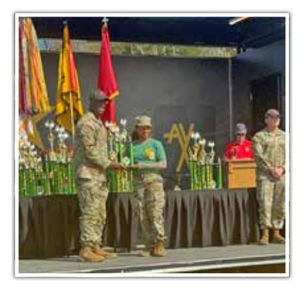
Mission accomplished, it's time to head home!