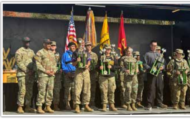
Atlantic Raiders placed 4th in the 5k run mixed division.