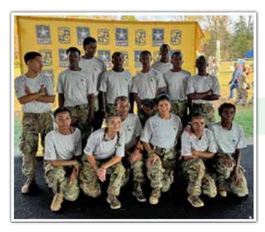
Physical Team Test (PTT) complete!